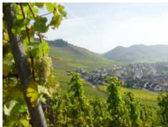
Ockfen (Saar) 24 th Oct. 2004