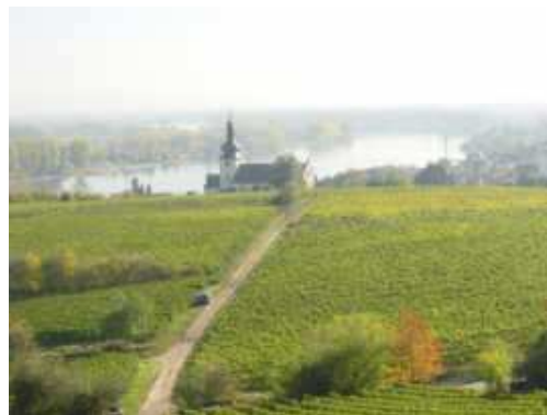
Nierstein (22nd Oct. 2004)