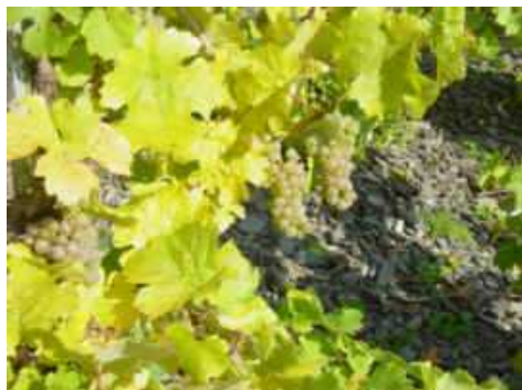
Riesling ripening on slate in Ockfen, 24 th Oct. 2004