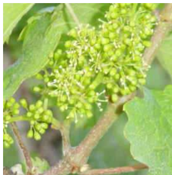
Riesling flowering 20 th June 2004