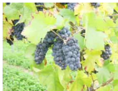
Pinot Noir ready for harvesting at 100 Oechsle Nackenheim, 13 th Oct. 2004