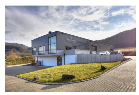
Bernkastel-Andel (new cellars)