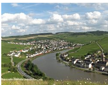
Nittel, left bank of the Mosel