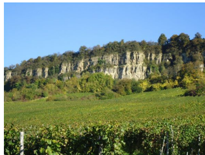
Nittel with its limestone rocks